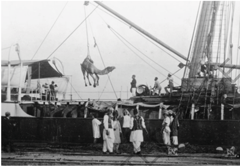
FIGURE 4 A camel being lifted off a boat in Port Augusta, South Australia, in 1920

It is likely that Australia has been known to the Islamic world for hundreds of years. There is even evidence to suggest that Islamic scholars knew about Australia as early as 820 CE! We know for certain that Indigenous Australians traded with the Macassans (from what is now Indonesia) who had converted to Islam in the seventeenth century. While there are records of a small number of Islamic convicts, the main period of Islamic immigration occurred with the arrival of the Afghan cameleers in the 1860s. With their expert knowledge of desert conditions, the cameleers were heavily involved in major construction projects across rural Australia. Despite its early success, Muslim immigration was severely restricted by the White Australia policy of the twentieth century. Since the official removal of this policy in 1973, Muslim immigration and the practice of Islam have steadily increased in Australia. Today, approximately 2.2 per cent of Australia's population is Muslim and 62 per cent of these people were born overseas.