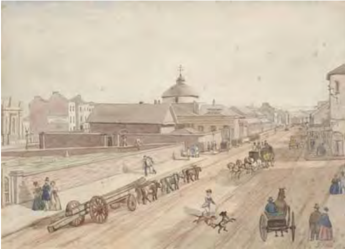
FIGURE 2 The first synagogue in Australia, York Street, New South Wales (1844). It is shown in the far left of the painting.

Together with Christianity, Judaism was one of the first religions practised in colonial Australia. Approximately 8 to 16 convicts on the First Fleet were Jewish, and the first Jewish free settlers arrived in the early nineteenth century. The number of Jewish immigrants continued to increase, with the majority initially coming from Britain and later from Germany. In 1844, the first Australian synagogue was built in Sydney (see figure 2), with places of worship in Hobart, Melbourne and Adelaide soon to follow. As with many migrant groups, the Jewish population in Australia increased during the gold rush. However, the biggest period of Jewish immigration occurred during and directly after World War II. Australia was one of the main countries of destination for Jews fleeing the atrocities of Nazi Germany. In fact, outside of Israel, Melbourne has the largest population of Holocaust survivors in the world. Today, Australian Jewish communities are small yet vibrant, with only 0.5 per cent of all Australians identifying themselves as being Jewish.