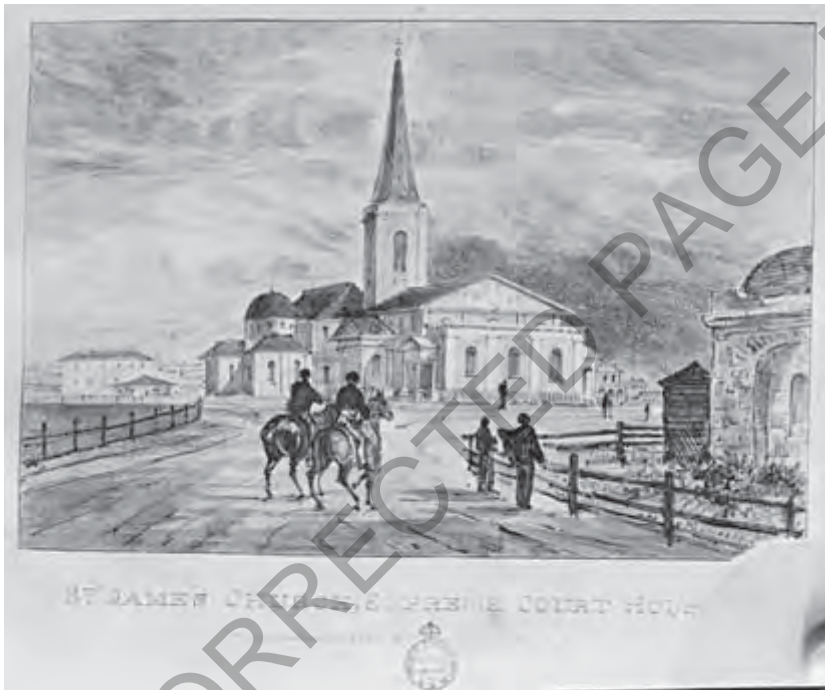
FIGURE 2 St James' Church, Sydney (1856), was an Anglican Church built with convict labour.

The vast majority of convicts and official members of the First Fleet identified themselves as Christian. Specifically, they were Anglican and therefore aligned with the Church of England. So strong was their connection to the Church that all public servants swore an oath to follow its doctrines . A small number of Irish Catholic convicts were also on the First Fleet and this denomination provided the main alternative to the Church of England. The popularity of Catholicism increased as transportation to the colonies continued. The First Fleet also contained practitioners of other religions such as Judaism. We will investigate the origins of these other observances later in this topic.