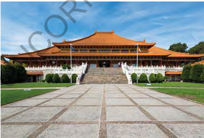
FIGURE 3 The Nan Tien Temple in Wollongong, New South Wales