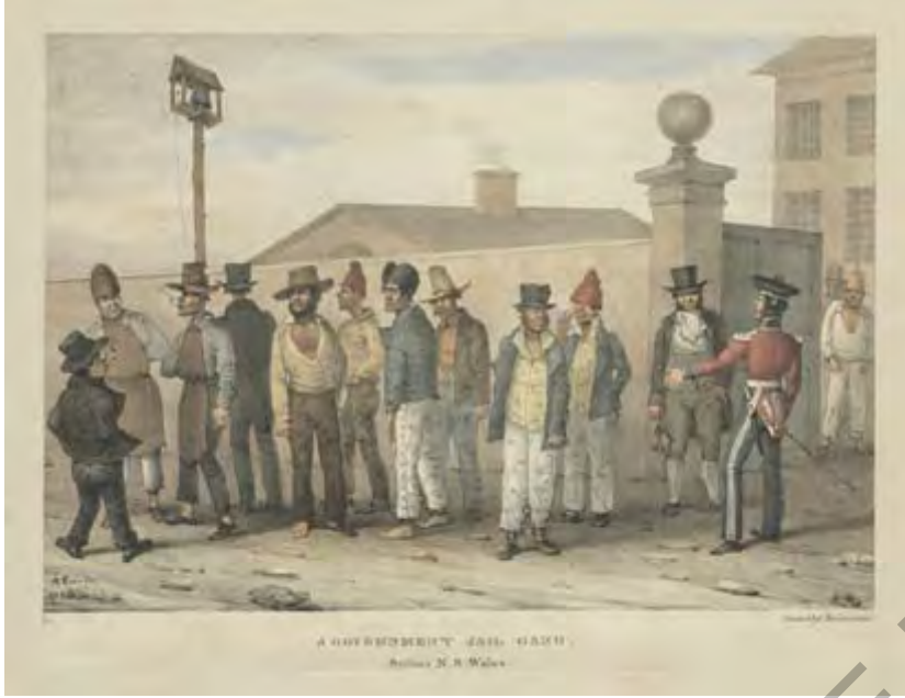
FIGURE 3 A government jail gang (1830), by Augustus Earle. The vast majority of convicts were Christian.